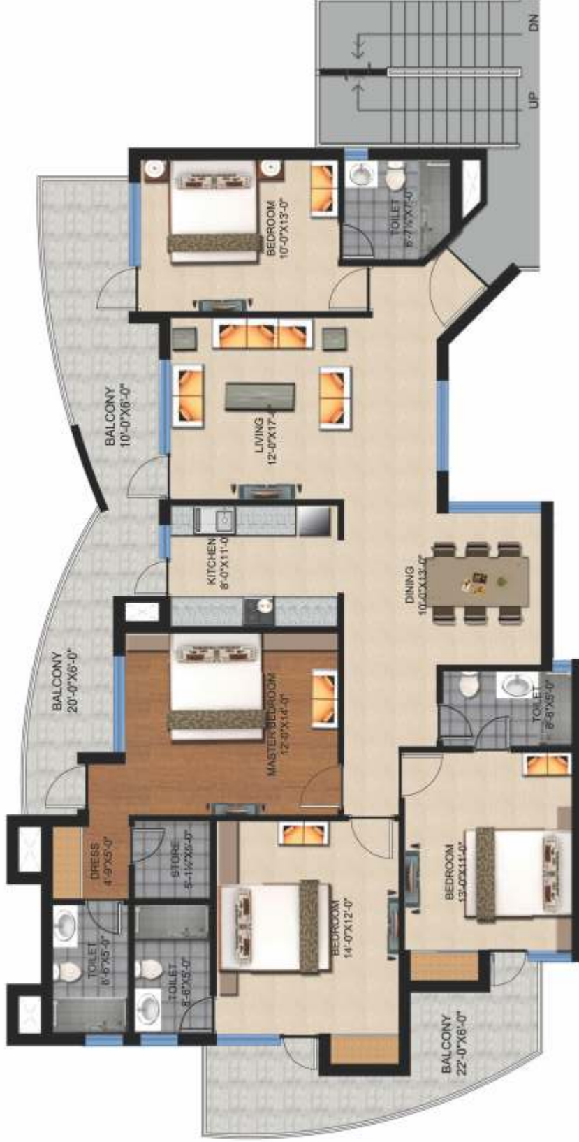
4 BEDROOM 4 TOILET TYPICAL UNIT PLAN