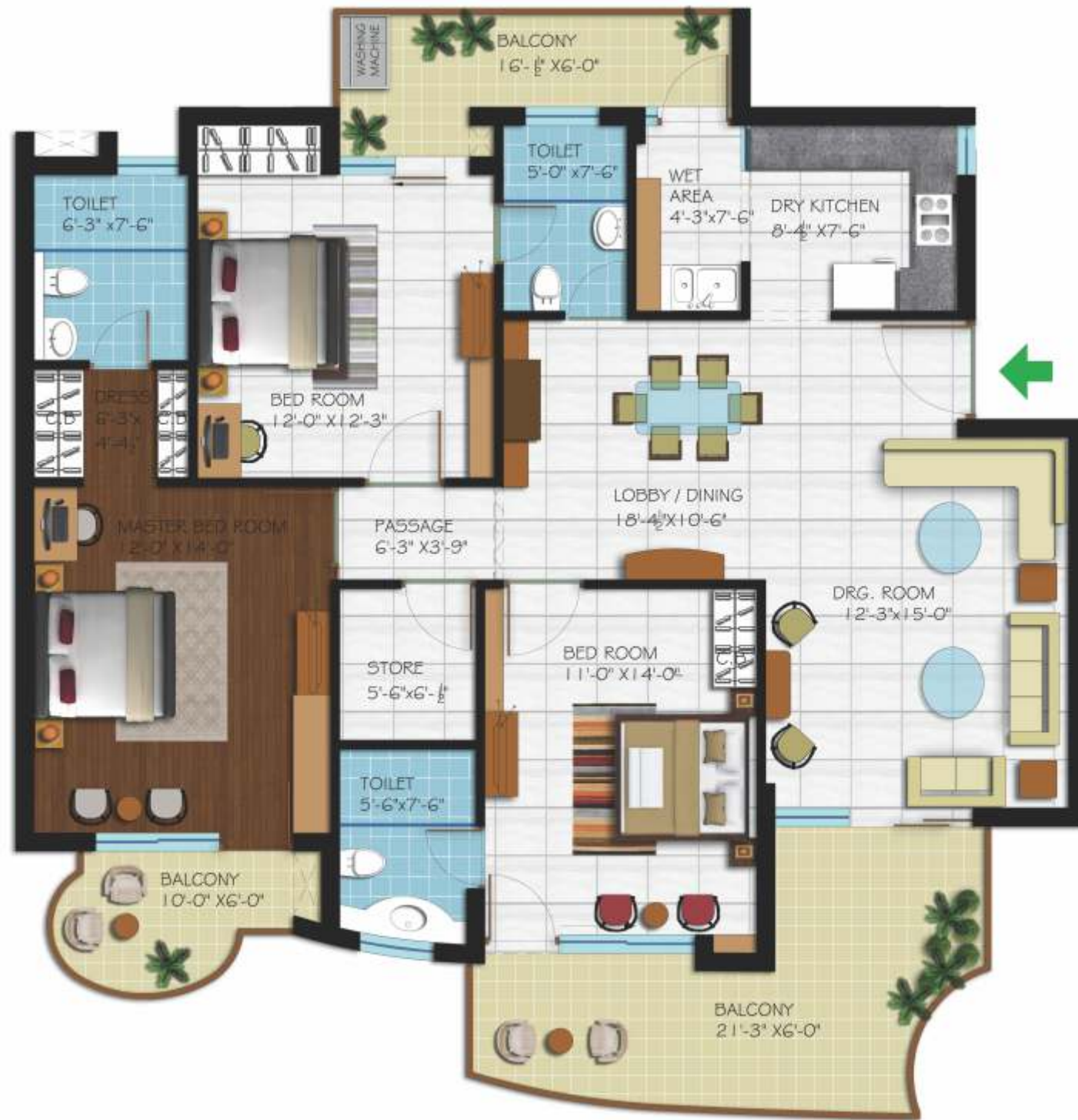
3 Bedrooms + 3 Toilets + Store Room (1910 sq.ft.)