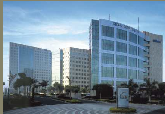
Global Business Park, Gurgaon