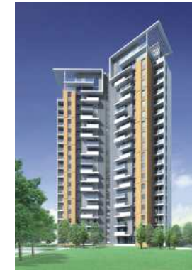
Cascades, Greater Noida

At present, Unitech has more than 22 major ongoing residential projects in cities like Delhi NCR, Mumbai, Kolkata, Chennai, Mohali and Lucknow.